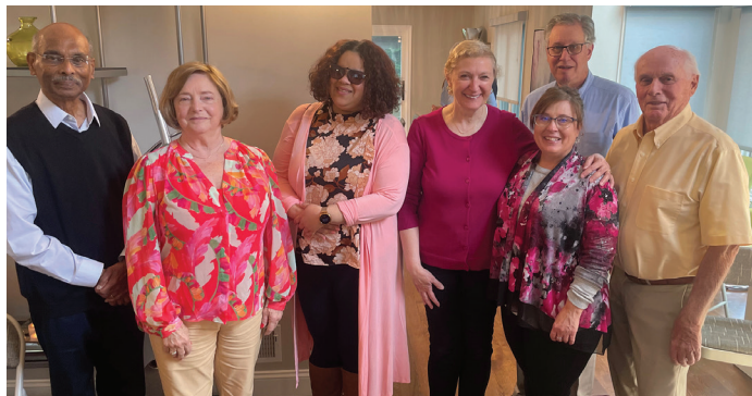
Long-time Board members celebrated at brunch event.