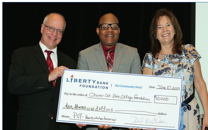
Foundation receives generous donation from Liberty Bank