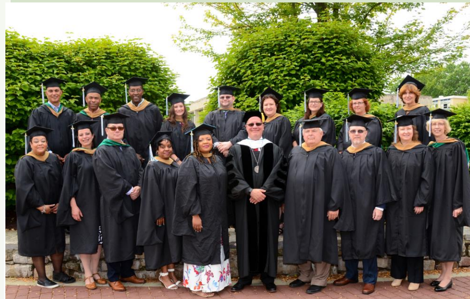
Master of Science in Organizational Effectiveness and Leadership Program – Class of 2019

Are you ready to take that first step? Feel free to contact Graduate Admissions at (860) 515-3701 or via email at gradadmissions@charteroak.edu with any questions you may have about the Master of Science in Organizational Effectiveness and Leadership degree or the Graduate Certificate programs.